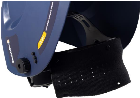
7.2 Fit the sweatband on the head harness.