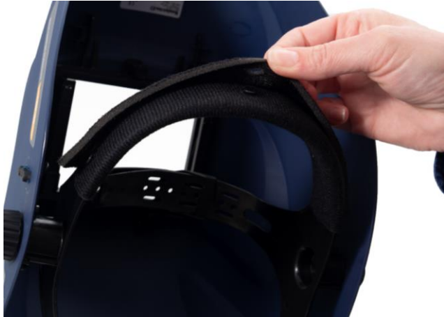
7.1 Remove the sweatband