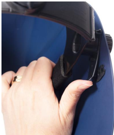
1.2 How high the welding shield sits on the head. The angle against the shield.