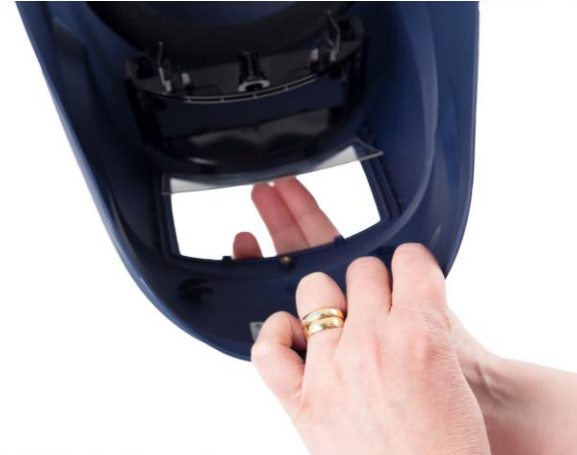
6.3 Release and remove the outer protective lens