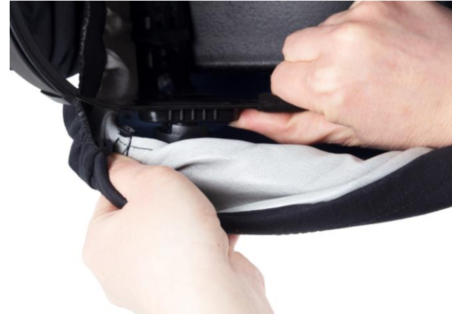
1.3 Space adjustment between shield and head harness. The space to the shield.