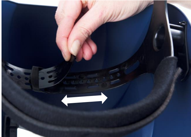
1.1 Height adjustment. How high the welding shield sits on the head.