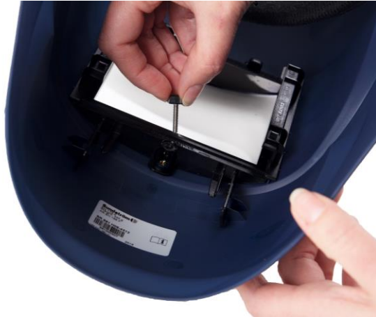
6.1 Loosen the screw in the holder for the welding filter.