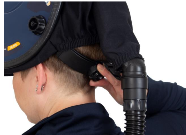
1.4 Width adjustment of the head harness. Adjustment of the width of the head harness.