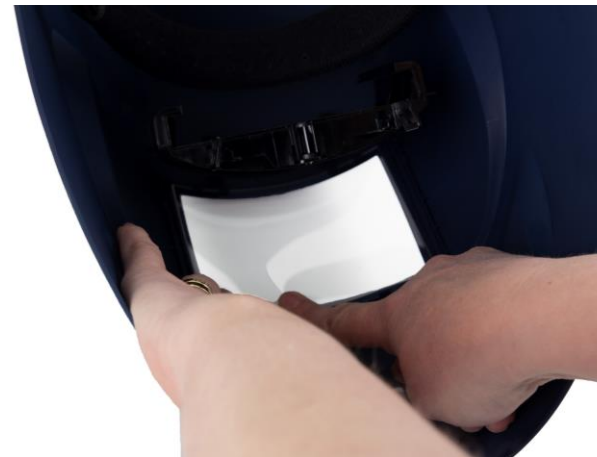
6.4 Fit the protective lens. Fit the holder. Tighten the screw.