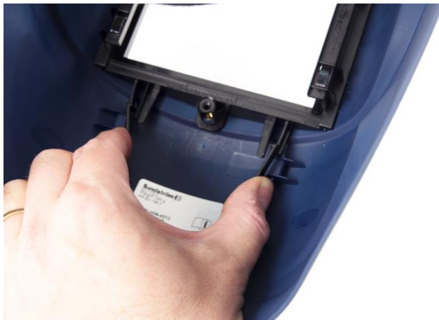
6.2 Release the holder for the welding filter.