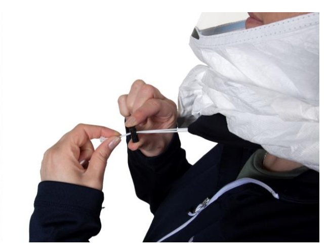
3.3 Adjust the neck size of the hood by means of the elastic neck strap.