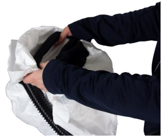
3.1 . Grip both sides of the hood opening with your hands.