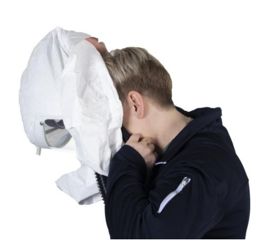
3.2 Insert your chin into the hood. Keep your grip of the hood and draw it over your head.