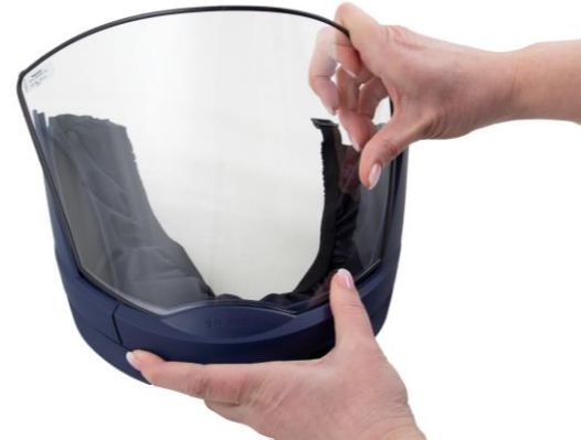
5.3 Remove the visor